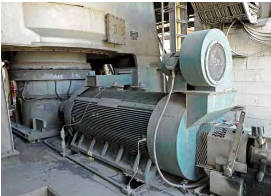
An 800 HP Baldor•Reliance TEFC (blower assist cooled) motor is used on the coal mill drive that grinds the coal used to fire the kiln.

Holcim (US) Inc. is a subsidiary of Holcim Ltd and one of the nation's leading manufacturers and suppliers of cement. The company operates 12 manufacturing plants in the United States, including the facility in Holly Hill, South Carolina.