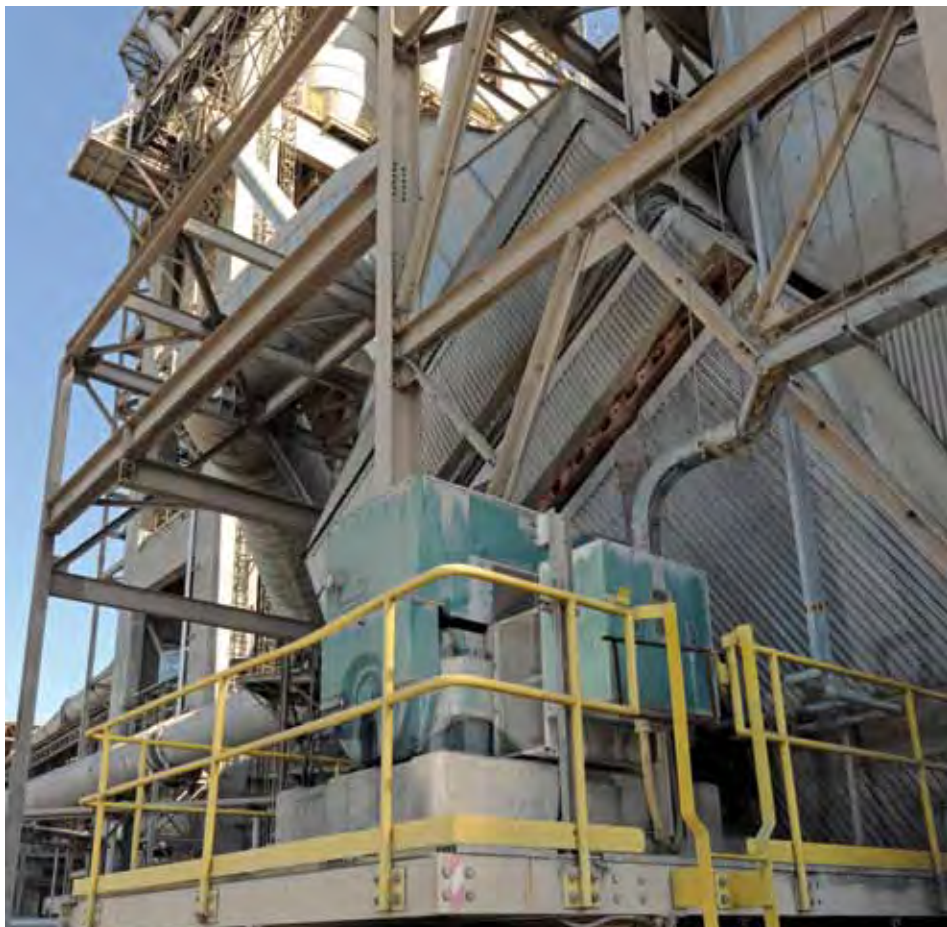
The dilution air fan is powered by a 700 HP WPPI Baldor•Reliance motor. This fan pulls heat from the clinker cooler to help dry raw materials in the raw mill using the hot gas generator.

"We routinely test our large AC motors, and I've been impressed with the results," says Davis. "When we meg these motors, we see very high resistance, which is good because we know we don't have to worry about the motors shorting out. I'm very pleased with these motors because they just run and run, and we sleep better knowing these motors test well."