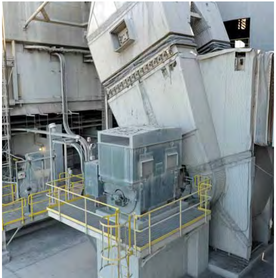
The kiln-induced draft (ID) fan is powered by a 5,000 HP WPII Baldor•Reliance large AC motor. The ID fan is a central element in the clinker production process as raw meal is fed into the kiln and sintered.