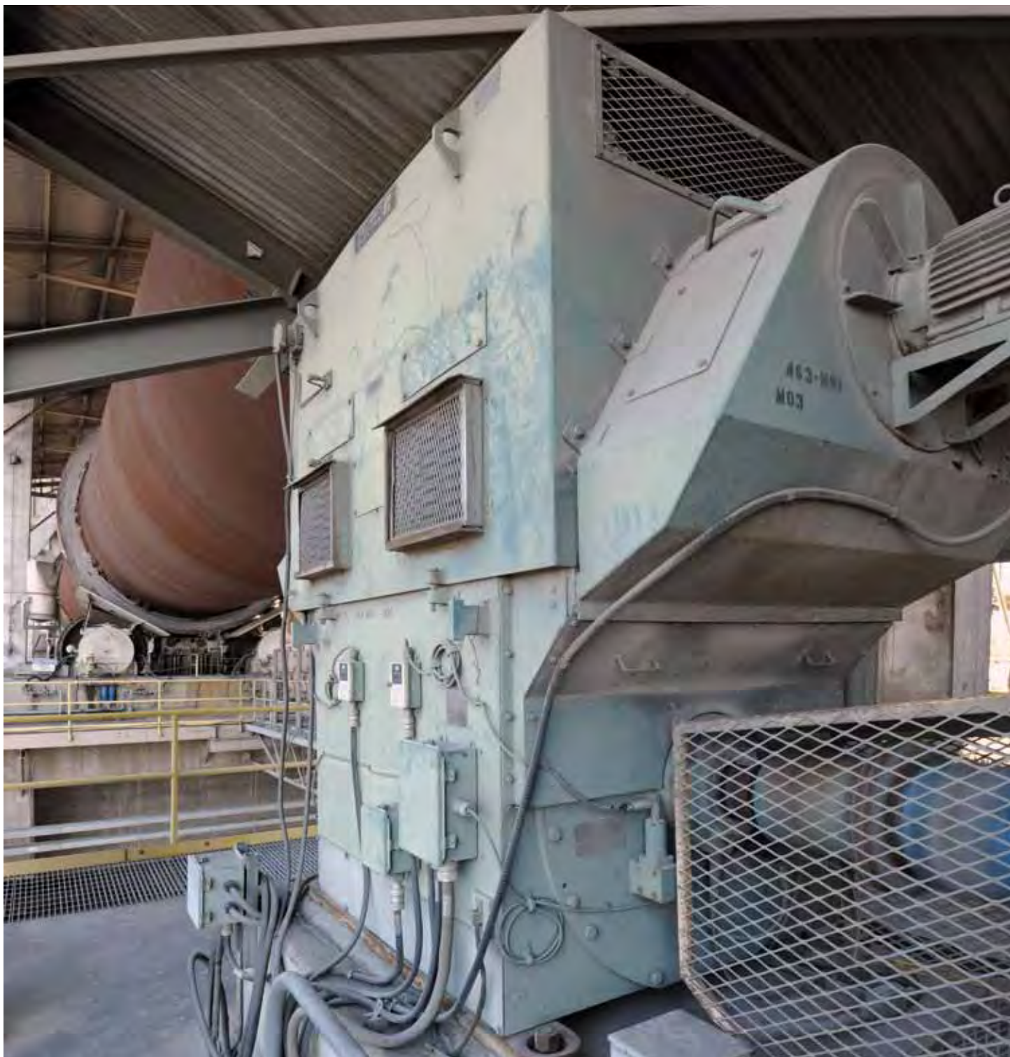
A Baldor•Reliance 1,200 HP WPII (blower assist cooled) motor rotates the kiln about one to three revolutions per minute. Raw meal in the kiln is heated to about 2,700 F to produce clinker, which is then cooled and ground into the gray powder known as Portland Cement.

week asking if we have any motors to be repaired, and it's a blessing for me to tell him no. These motors are so dependable the repair people no longer get any work from us, and that's a very good thing."