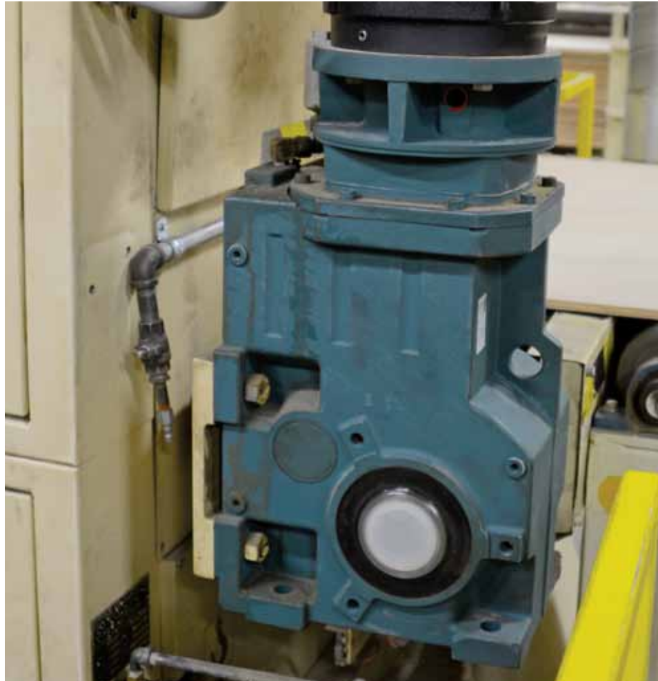
This size 108 RHB Quantis reducer replaced a competitor's gearbox so operators can better control the speed of the transfer belts on a sanding machine. Some wood panels need to be sanded quickly while others need to be sanded more slowly. With the Quantis gearbox installed, operators can now utilize the full speed range of the sander.