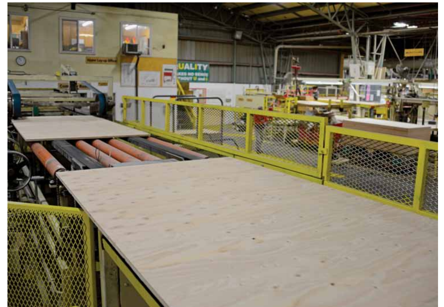
Baldor's Dodge Quantis reducers help power the newly built equipment that ties the poly line, the panel turner and the sanding line into one continuous process.