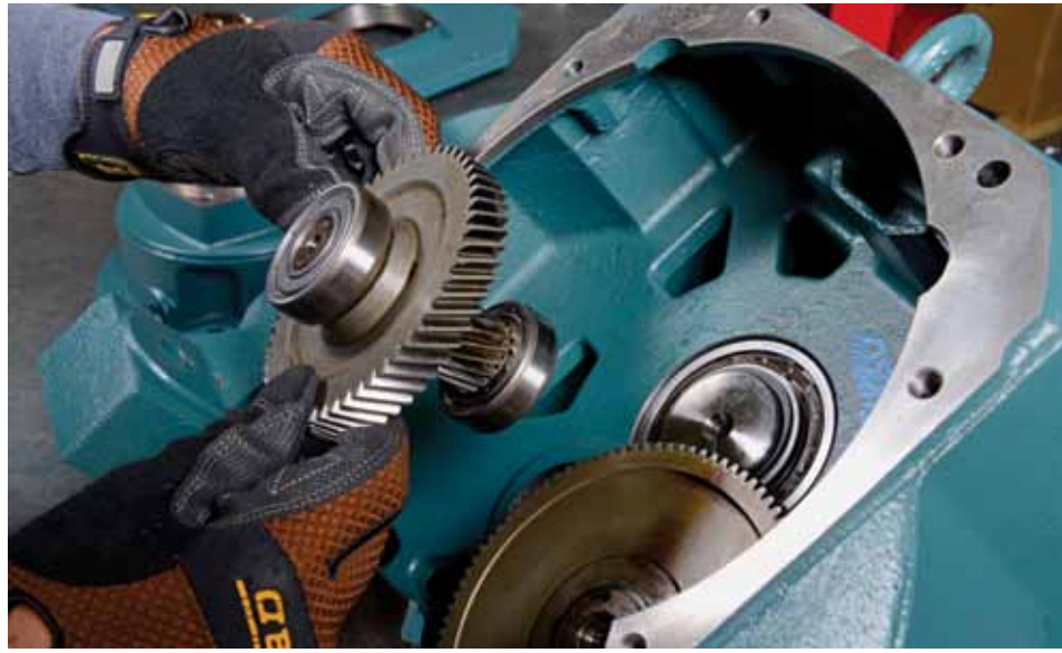
With a large inventory of preselected components, trained technicians at Baldor's Dodge Quantis Build Center in Reno can build gearboxes with an extensive variety of power ratings, ratios and shaft configurations.

With a large inventory of preselected components, trained technicians can build gearboxes with an extensive variety of power ratings, ratios and shaft configurations.