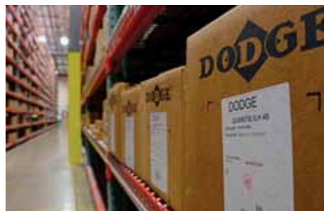
With a variety of units in stock, and the flexibility to build to customer specifications, Baldor's Dodge Quantis Build Center is ready to deliver.

Input options include integral motors, clamp collar style, or 3-piece coupled. Output options include solid shaft, straight hollow bore and the exclusive Dodge Twin Tapered bushing system.