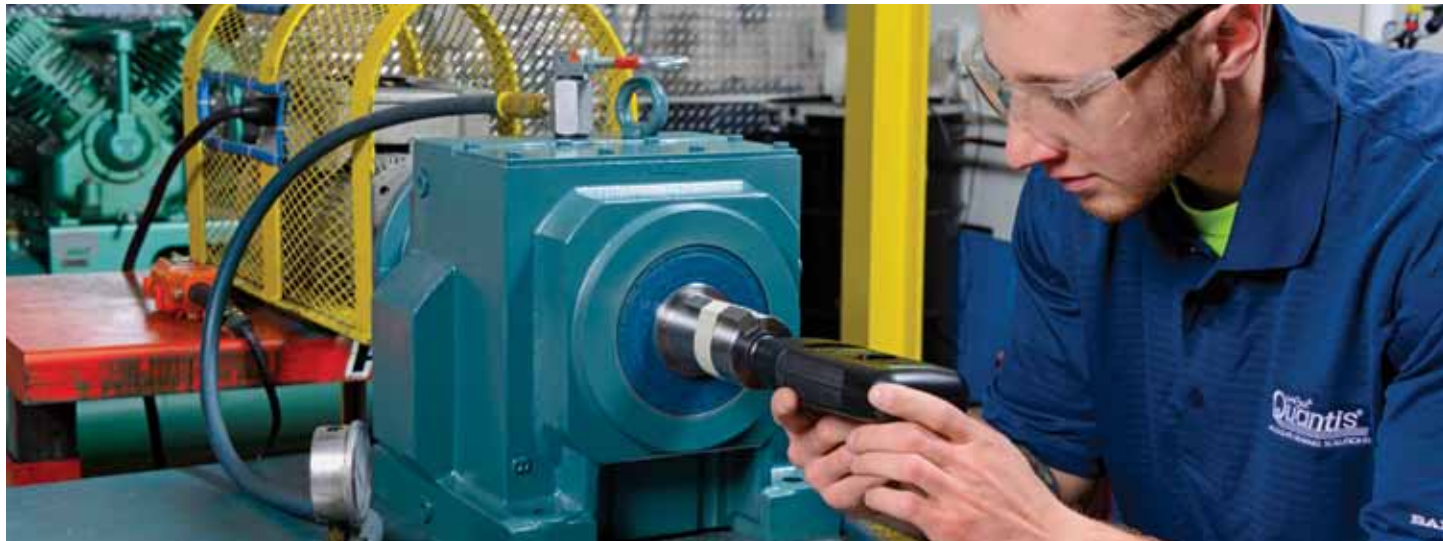
To ensure top quality, each Quantis reducer is tested prior to shipping.