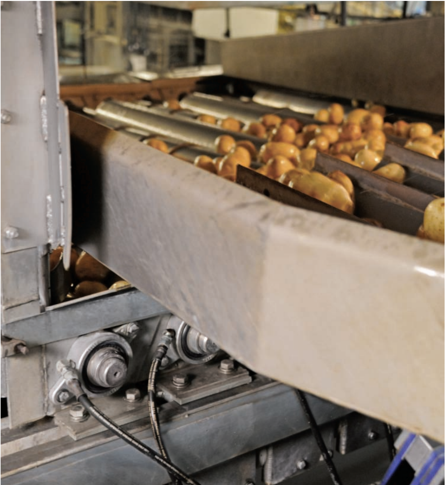
Bearing failures on this roll sizer machine were causing significant downtime at the Lamb Weston potato products plant. After installing Baldor's Dodge ULTRA KLEEN stainless steel ball bearings, this machine went from being the least reliable to the most reliable.

water usage, waste and packaging. In an effort to help achieve those goals, the company is working with its supply