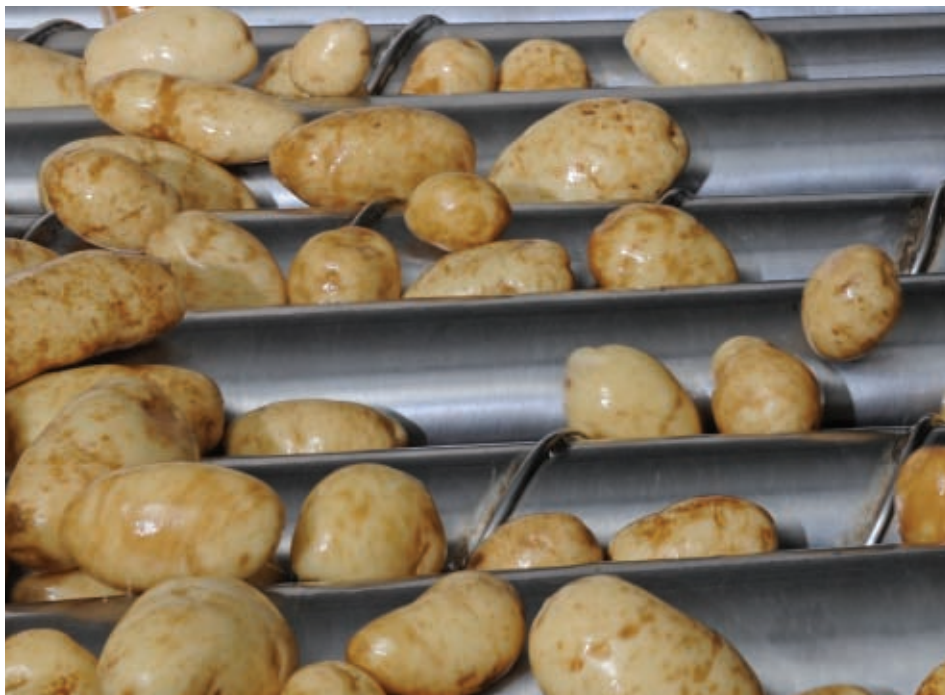
Eleven tapered rollers on this roll sizer machine drop clean potatoes by size into the appropriate flume, carrying them to the next step in the process. Before making the conversion to the Baldor•Dodge® ULTRA KLEEN product, bearings on both ends of the rollers were failing due to sealing issues.

“In the past, keeping this roll sizer up and running was a real challenge,” says Walters. “Unplanned downtime is costly in so many ways, and it’s also very disruptive to the planned preventive maintenance work that we do in the plant. With this problem solved, we can move to other improvement projects. Solving the problem has been a big win for us.”